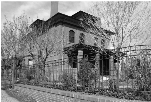
In partnership with Providence Network - Our Transformation Home will open in 2017!