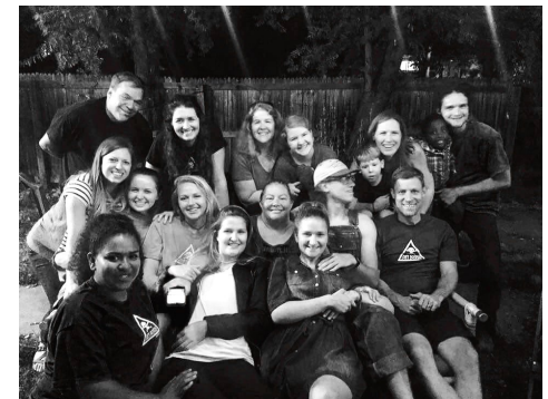
Dry Bones summer interns. In 2016, we hosted 10 interns throughout the year. We also welcomed 15 visiting vision trip groups.