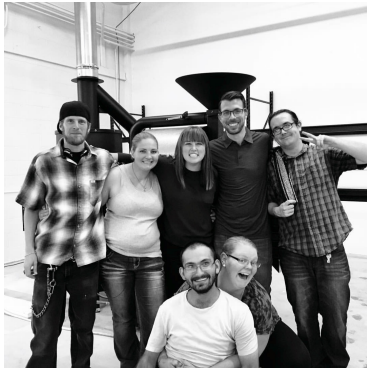
New Purple Door Coffee Roaster Warehouse! Get ready to order PDC coffee for your house, office, and church. Help employ more youth and young adults leaving the streets.