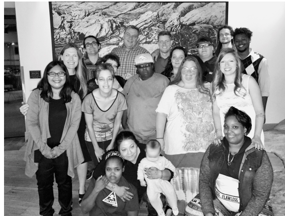
Dry Bones 15th Birthday Party at Red Rocks!