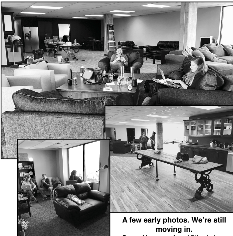
A few early photos. We're still moving in. Open House - Jan 15th, 1-4pm